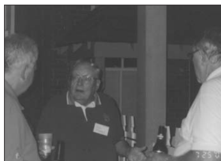
No, I won't Pay!