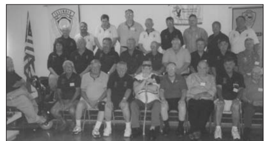
ILJCI Presidents from #1 to #43