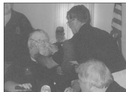
Koochy, Koochy, Koo!