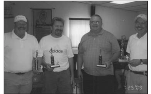
Golf Tourney Team Winners at Picnic