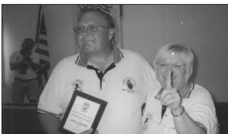
US Senate, Return the Favor, Individual Senator Monty Schroeder