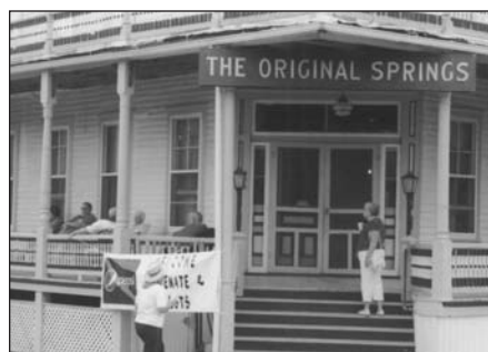
The Original Springs Hotel