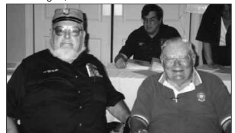
Reb & Yankee