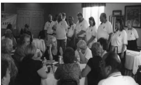
Swearing in the 2008-09 Board