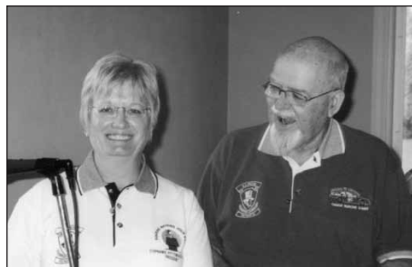
President Snoopy with Chuck Busche #4001, low Senate number