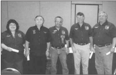
Awards to Treasurer's Chairs