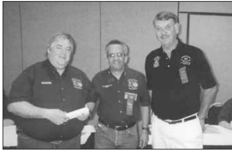
Awards to Administrative Chairs