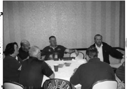
Way too serious!