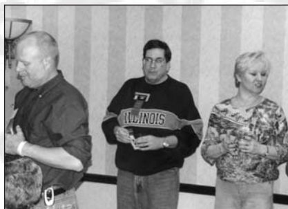
Hey! I'm the leader, now pay attention!