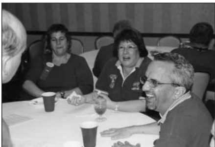
Now, that's funny!