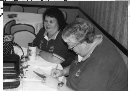
The Treasurer's work is never done