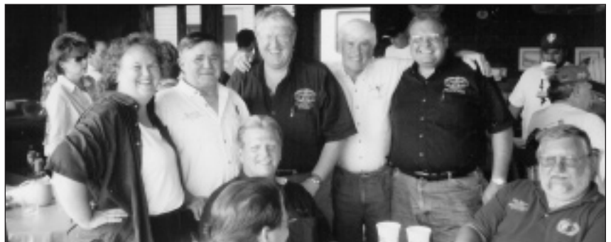
Kentucky Bourbon Bash